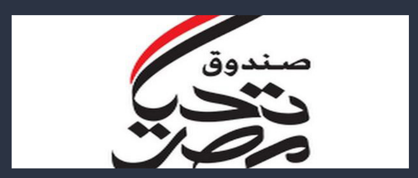
The Social Housing Fund