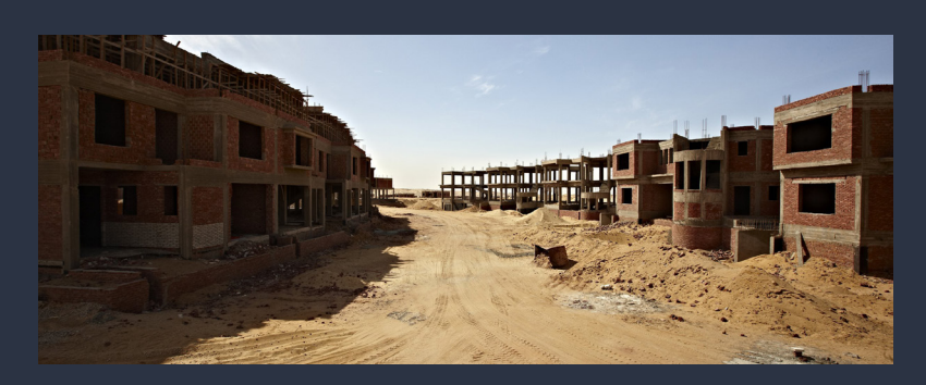
Breakdown by City

Information in this report is based on official announcements by both developers and the Egyptian government. All figures and facts obtained through news mediums have been confirmed from at least two different sources. This text is intended solely for general market evaluation purposes. Any decisions based on conclusions from this document is the sole responsibility of the reader. Reproduction of any part of this document is prohibited without written consent.