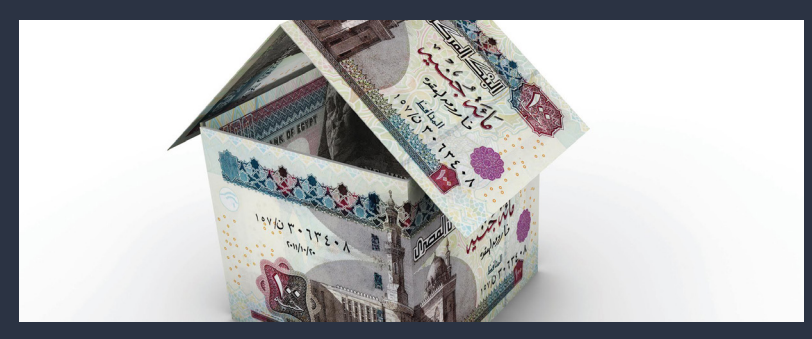
Tahya Masr Social Housing Fund