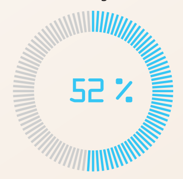
Percentage of Land Tendered for Social Housing - 2016