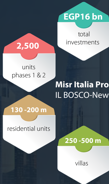
Misr Italia Properties: IL BOSCO-New Capital

Private developers have dashed to acquire land plots for residential projects in the New Administrative Capital, each attempting to illustrate their uniqueness by various ways such as selecting a particular whimsical theme for their projects, a premium location within the capital, or the types of units they offer.