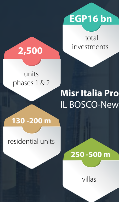
Misr Italia Properties: IL BOSCO-New Capital

Private developers have dashed to acquire land plots for residential projects in the New Administrative Capital, each attempting to illustrate their uniqueness by various ways such as selecting a particular whimsical theme for their projects, a premium location within the capital, or the types of units they offer.