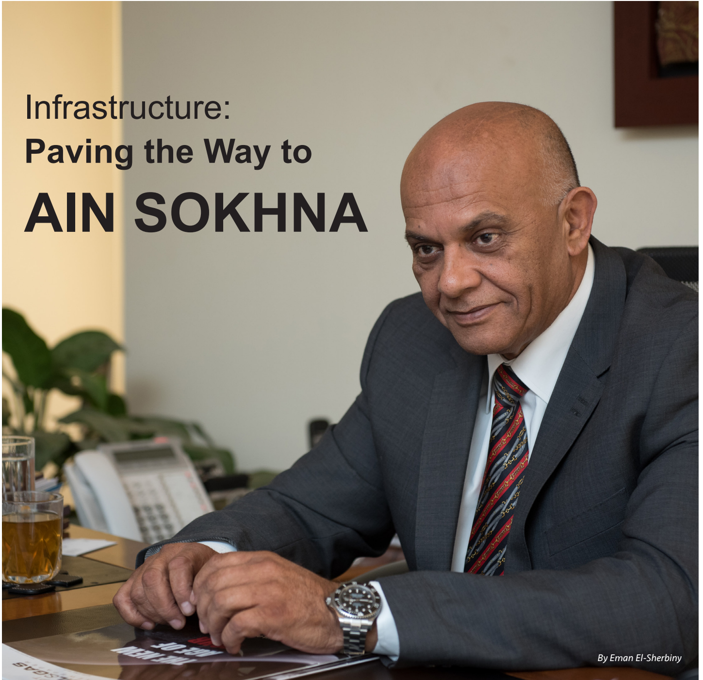
By Eman El-Sherbiny

For quite some time, infrastructure and public economic growth have been entwined reflecting the magnanimity of infrastructure projects on the real estate market in Egypt to a great extent.